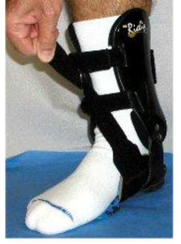
2. Pull upwards on Arch Suspender strap while rolling your own foot slightly to the outside. Feel the strap lifting your arch.