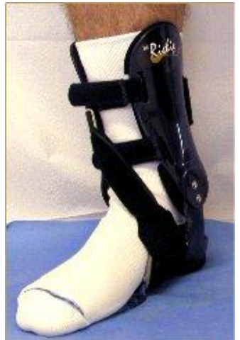
3. When a comfortable lifting support is felt under your arch, secure the strap back down upon itself across the top of the arch. Further adjustment (tightening or loosening) may be necessary after you initially walk with the Richie Brace® and Arch Suspender in place.